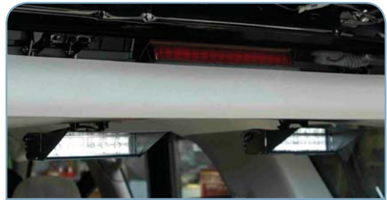
Dual Predator Lights mounted to the rear headliner in the back window of a Ford Explorer.