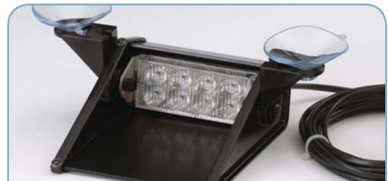
Lights include Suction Cup Mount with adjustable brackets & 11.5’ cord with 12v cigar plug (single shown)