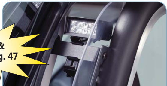
Single Windshield light mounted with optional Prisoner Screen Bracket (windshield shroud removed).