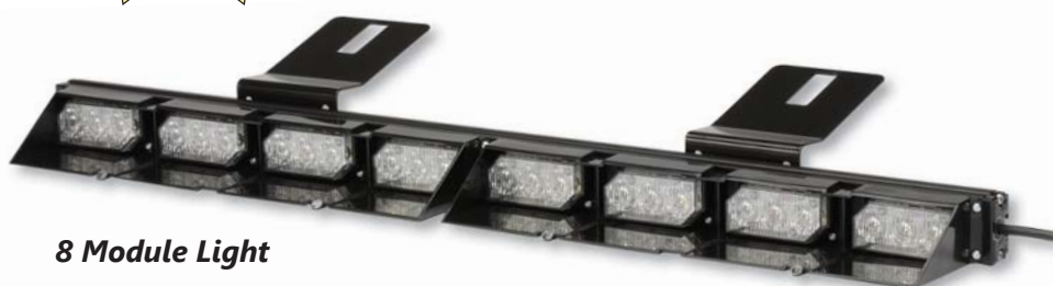
8 Module Light