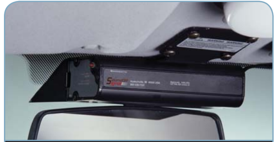
Dual Light with Permanent Mount mounted above the rear view mirror in the windshield.