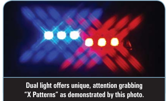
Dual light offers unique, attention grabbing “X Patterns” as demonstrated by this photo.