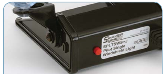
Light has convenient, quick access rear switch for Flash Pattern change & powering on or off.