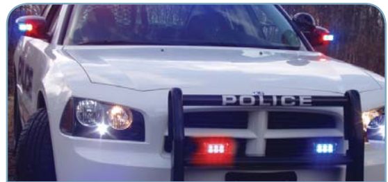
Two Predator™ Single lights mounted to the push bumper of a Dodge Charger (surface mounts shown on mirrors, pg 47).