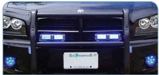
Predator 2™ Dual lights in Blue LEDs mounted to the push bumper of a Dodge Charger Police vehicle.