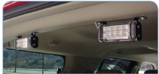
Predator 2™ Single lights mounted to the rear headliner boost rear visibility to oncoming motorists.