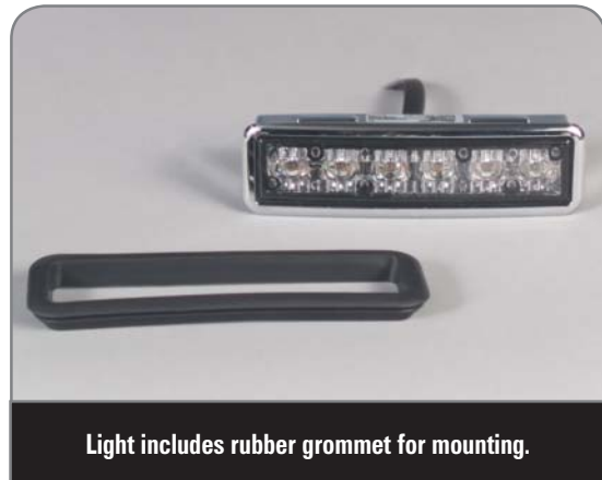
Light includes rubber grommet for mounting.

Black Housing: #EGHSTT5(x)B Chrome Housing: #EGHSTT5(x)C White Housing: #EGHSTT5(x)W