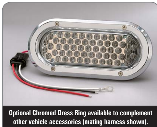
Optional Chromed Dress Ring available to complement other vehicle accessories (mating harness shown).