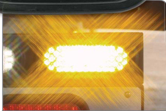
Intense & bright Gen2 LEDs power our O6 Series Warning Light. Amber LED light shown.