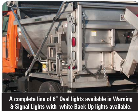
A complete line of 6" Oval lights available in Warning & Signal Lights with white Back Up lights available.

Ask to see our Bus Catalog for all Signal, Back Up, Marker & Licence Plate Lights