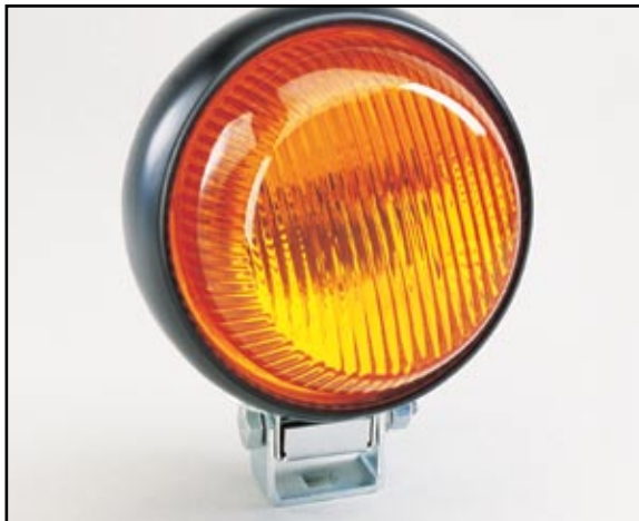
Available in Amber, Blue, Green, Red & Clear Lenses. Stainless steel bracket included.