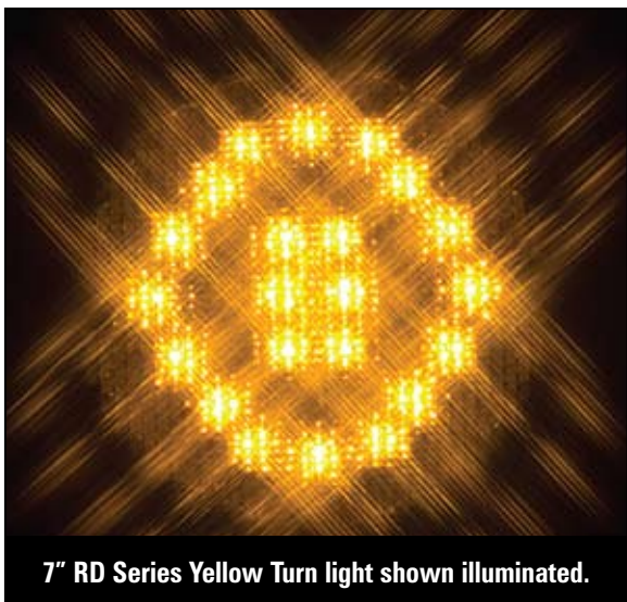
7" RD Series Yellow Turn light shown illuminated.